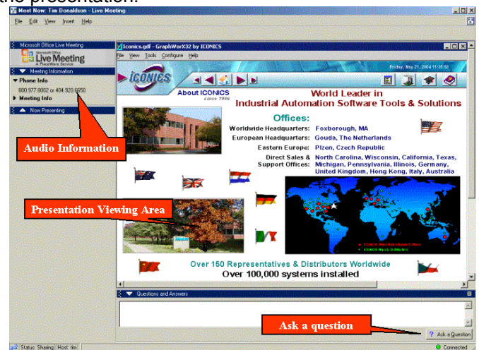
Sample ICONICS Webcast

During the Webcast all attendees will be in a listen only mode. Questions can be entered via the "ask a question" button in the lower right hand corner. At the conclusion of the presentation the presenter will also users to enter question via the audio portion. To do this enter *1 on your telephone keypad. If your question was already asked or to exist the question queue enter # on your telephone keyed All questions will be answered at the conclusion of the presentation.