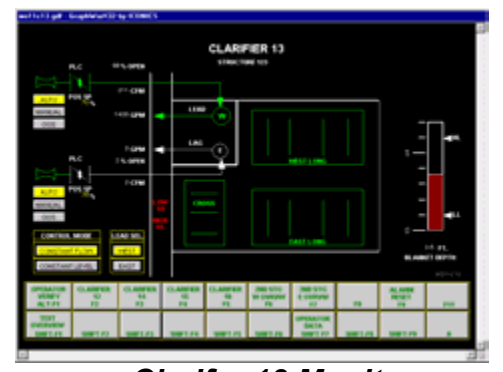
Clarifer 13 Monitor GraphWorX32 overview screen