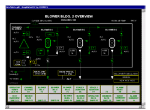
Blower Building 2 GraphWorX32 overview screen