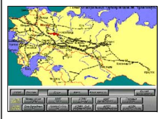
GraphWorX32 Screen: Pipeline Control