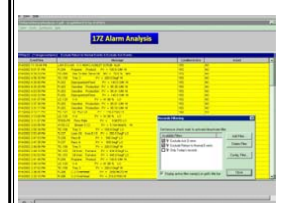
Alarm Summary Display