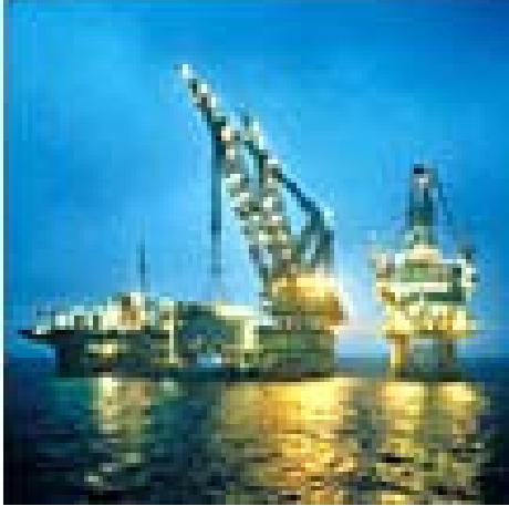
LIIEC Ocean Rig