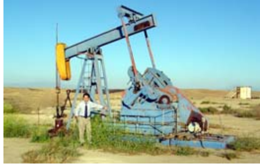
LIIEC Oil Rig Unit